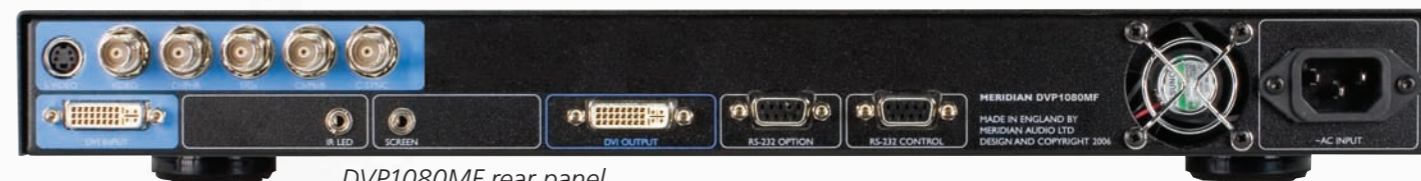
DVP1080MF rear panel